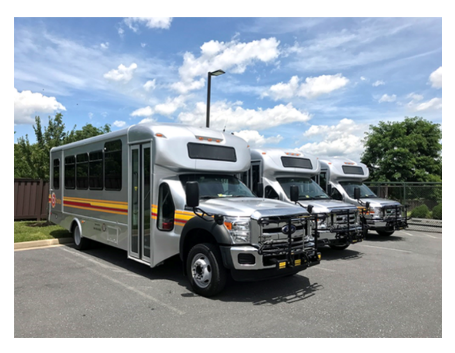
New BRITE buses

Dinner will be Oct. 7 starting at 6 p.m. at 300 N. Winchester Ave. in Waynesboro. Attire is casual. Tickets are $80. To buy a ticket go to <u>Waynesboro.va.us/166/Parks-Recreation (http://www.waynesboro.va.us/166/Parks-Recreation)</u> or click <u>here (https://secure.rec1.com/WA/waynesboro-va/wa/catalog?filter=c2VhcmNoPTQxMTk4Ng==)</u>.