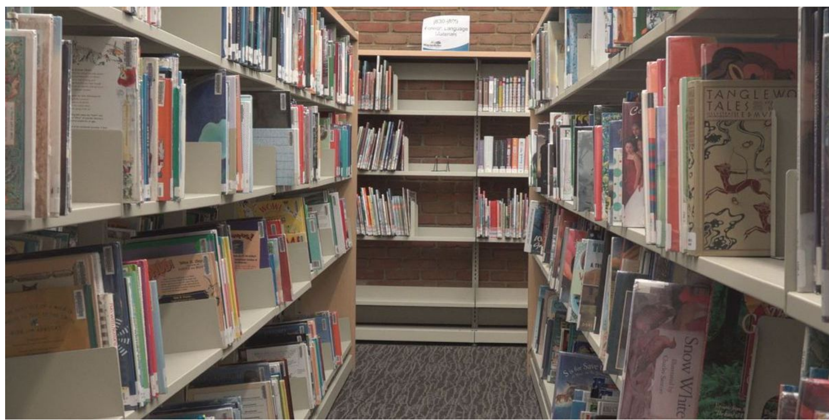
Library shelves

June 24, 2020 at 10:31 AM EDT - Updated June 24 at 10:31 AM